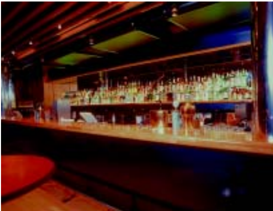
Capture Bar solution installed